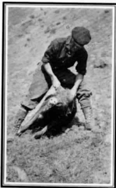
A FAIR-SIZED SPECIMEN.